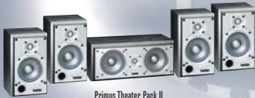
Primus Theater Pack II