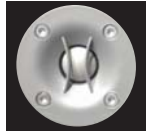
The MMD tweeter and waveguide deliver wider, more even high-frequency response.

For nearly 40 years, Infinity has set new standards for performance, simplicity and style. Now, Infinity's unchallenged leadership in loudspeaker design extends from our critically acclaimed Infinity Cascade™ Series to the stylish new Primus loudspeakers, inspired by the award-winning Cascade.