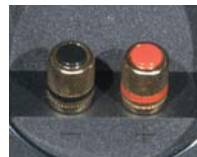
Five-way binding posts provide secure connection and easy setup.

Sound that commands your focused, undivided attention, transforming the act of listening from a passive pursuit to an engaging endeavor. That's the heritage of Infinity – and the promise of Primus.