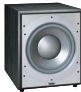
Add the PS28, PS210 or PS212 powered subwoofer for incredible music and home theater excitement.

From unobtrusive bookshelf music systems to dazzlingly powerful home theaters, there's a Primus system that's right for every purpose and room in your home. Infinity also offers three powered subwoofers to perfectly complement your Primus speakers. A recommended addition to any system, these three subs allow you to duplicate the cinematic experience at home.